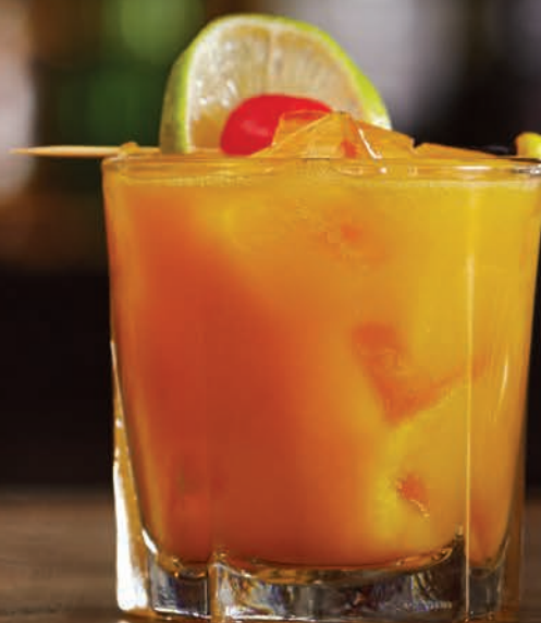
Son of a Gun WHISKY, MANGO, LEMON HH55 / $110