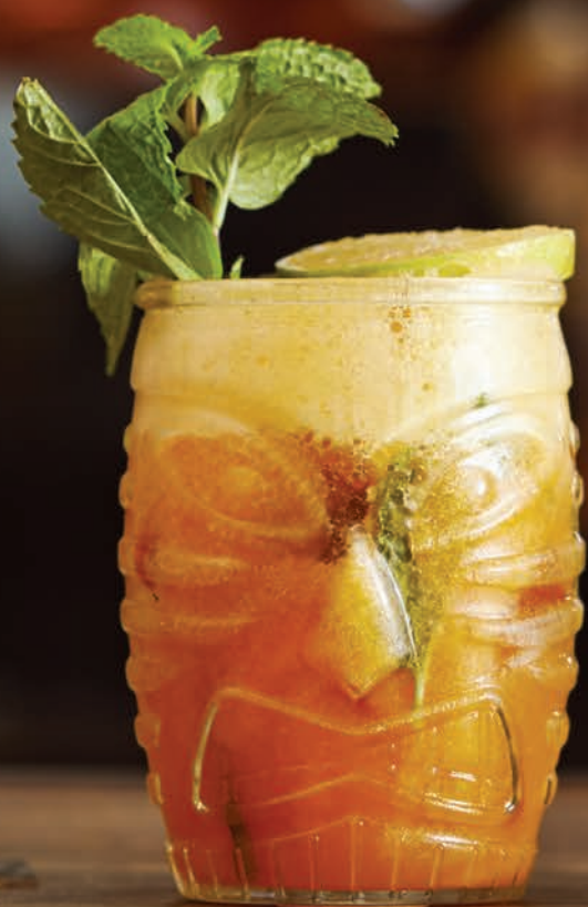
Tropical Mojito RUM, PASSIONFRUIT, LEMON, FRESH MINT, SUGAR HH55 / $110