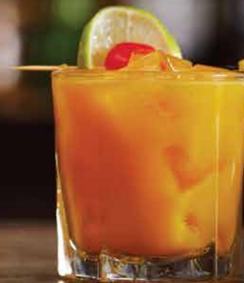
Son of a Gun WHISKY, MANGO, LEMON HH55 / $110