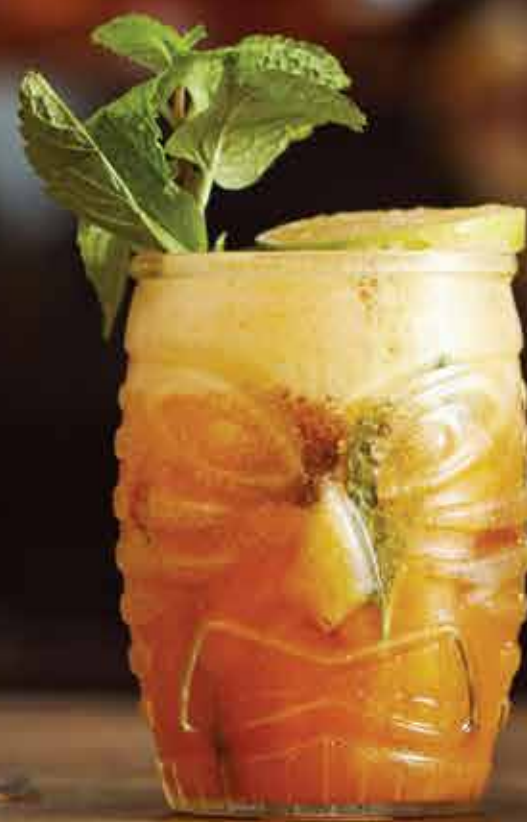
Tropical Mojito RUM, PASSIONFRUIT, LEMON, FRESH MINT, SUGAR HH55 / $110