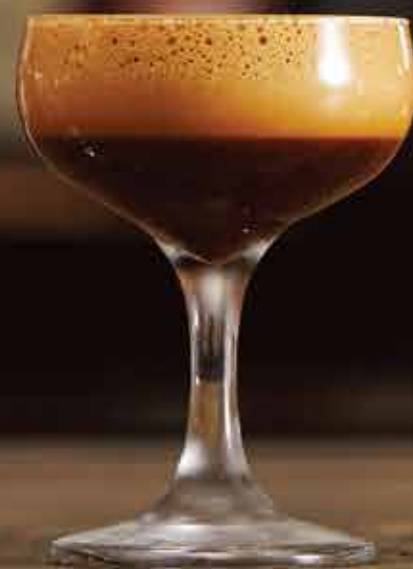
Wake Me Up VODKA, COFFEE LIQUEUR, ESPRESSO, SUGAR HH55 / $110