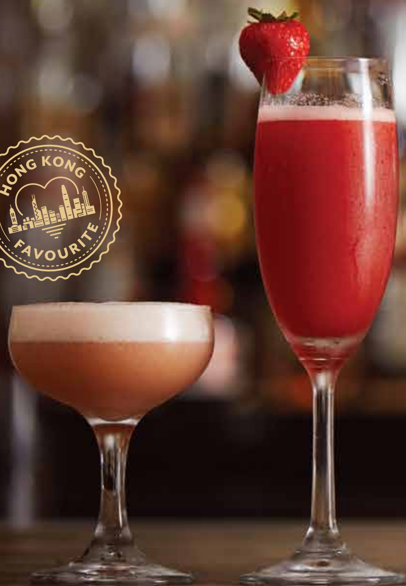
Lucky Peach GIN, PEACH, LEMON, SUGAR HH55 / $110