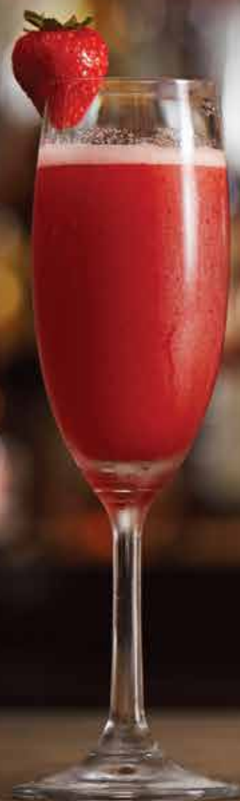
Duke of Berry STRAWBERRY, PROSECCO HH55 / $110